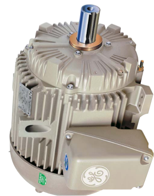
XSD Ultra 661