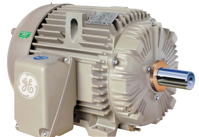
XSD Ultra 841